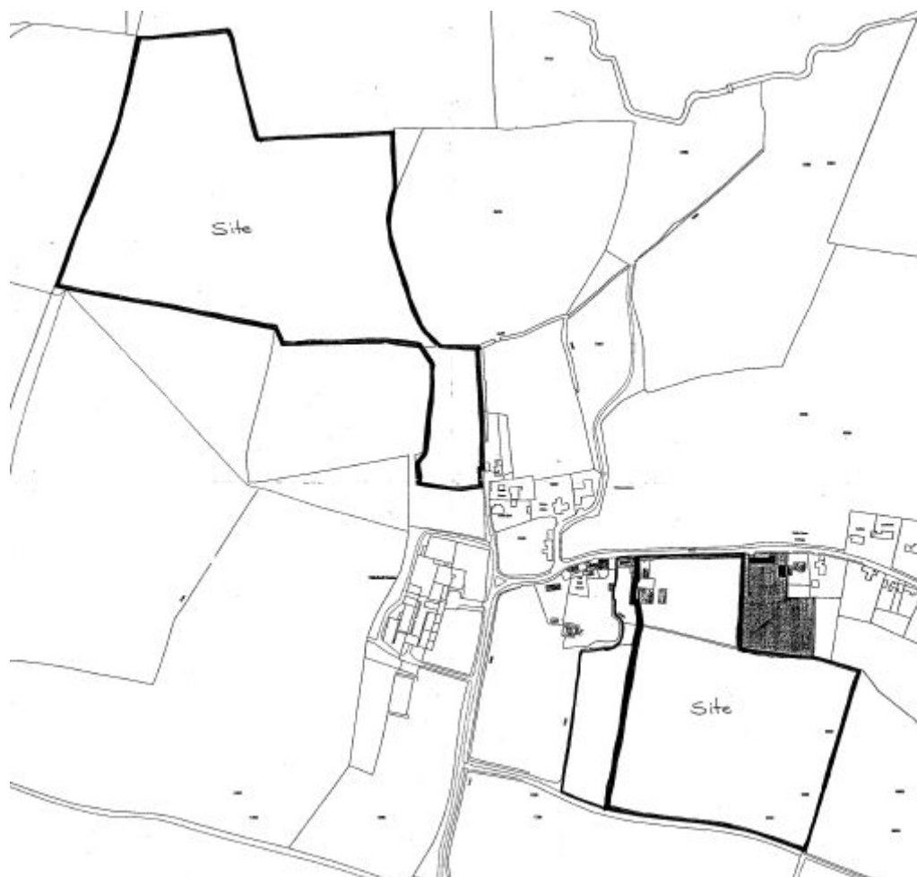
Site location plan

Old Dairy) and two barns. The second parcel of land lies to the north-west of the village and is slightly larger at approximately 7.7 hectares. There are no buildings on this parcel of land.